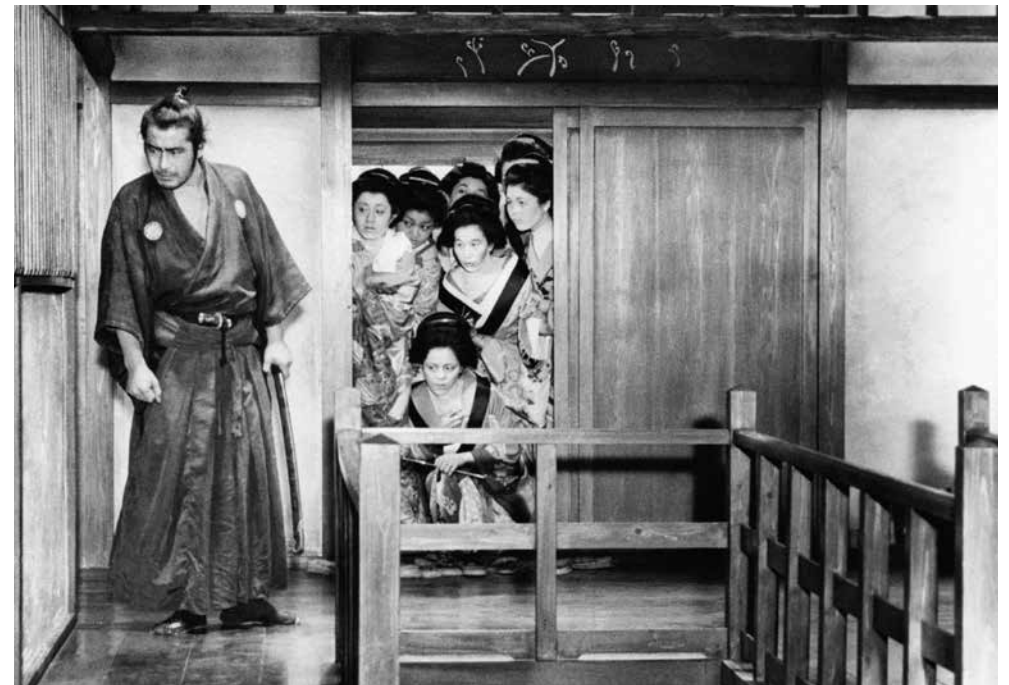
Toshiro Mifune in Yojimbo by Akira Kurosawa (1961)

FILMS PRESENTED: Drunken Angel by Akira Kurosawa (1948) – Rashomon by Akira Kurosawa (1950) – The Life of Oharu by Kenji Mizoguchi (1952) – Seven Samurai by Akira Kurosawa (1954) – Samurai I: Musashi Miyamoto by Hiroshi Inagaki (1954) – The Rickshaw Man by Hiroshi Inagaki (1958) – Yojimbo by Akira Kurosawa (1961) – High and Low by Akira Kurosawa (1963) – Red Beard by Akira Kurosawa (1965) – Hell in the Pacific by John Boorman (1968) – Red Sun by Terence Young (1971) – Mifune director: Legacy of the 500,000 by Toshiro Mifune (1963)