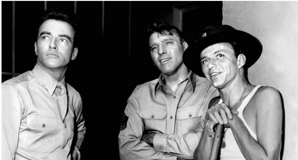
Montgomery Clift, Burt Lancaster and Frank Sinatra in From Here to Eternity (1953)

PLEASE NOTE: A special feature on Fred Zinnemann, including a (previously unpublished) major interview will be featured in the October issue of Positif magazine.