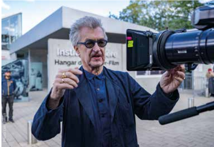
Wim Wenders filming, 21 October 2023

On 19 March 1895, Louis and Auguste Lumière shot the first film with the Cinématograph, Leaving the Lumière Factories , on chemin Saint-Victor, opposite the family factory.